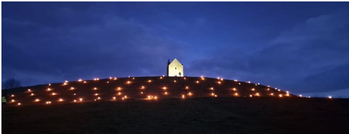
The Spiral of Light festival in Bruton was opened by the bells of St Mary's in February