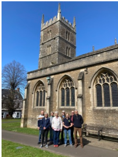
The band clockwise from front right.