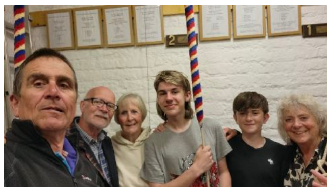
Charlton Mackrell and Charlton Adam ringers combined to ring at Charlton Mackrell: