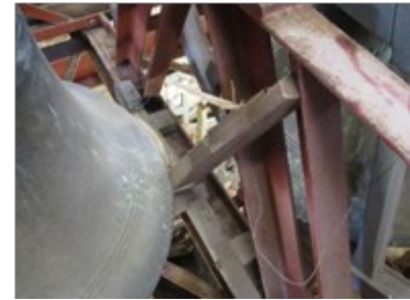
The stay jammed between the slider, frame and bell.

All in all, a bit of a mess. The bells will be out of action for a bit until the damage can be repaired, which may be an issue as the Church has very little money at the present time. Unfortunately this is not something that can be done locally as the bell will have to be lifted to clear the bearing and the frame. It is to be hoped that the frame may pop back into place but I am not holding my breath on that happening.