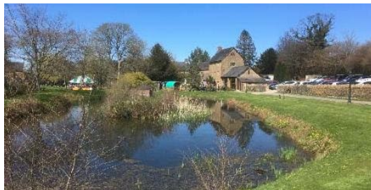
Haselbury Mill - the lunch venue.

At the Mill we were allocated a private room so we could make as much "noise" as we wanted....lots of chat and meeting old and new friends over an excellent lunch served promptly which gave even more time for reminiscing after lunch over coffee.