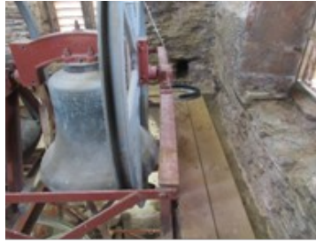
The frame on the wheel side now slightly bent.