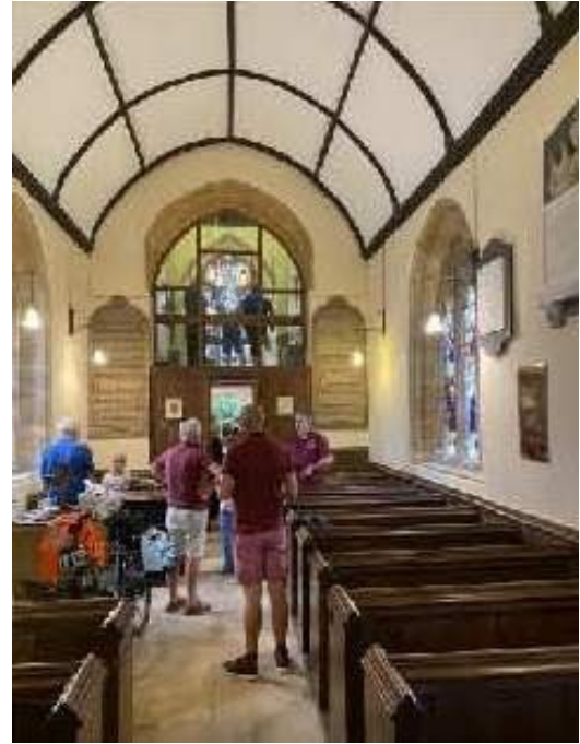
St Aldhelm and St Eadburga Broadway.

A happy band: "Thoroughly enjoyed it", "A great lunch venue", "a grand day out, "Ringing in new towers is always a treat, "A lovely day with some ringing friends old and new" - the West Monkton and Friends September Jaunt.