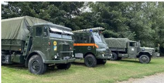
The Da Nang taxi from Vietnam... How did it get here?

Next stop- lunch at the wonderful Haselbury Mill, where an odd collection of vehicles greeted us on the drive.