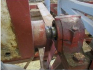
The stay side gudgeon pin out of the bearing housing.