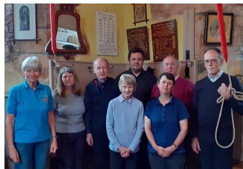
Raising the tenor at Withycombe (9/11), handbells at Carhampton (11/9) and the bands at Withycombe (10/9) and at Dunster (19/9)

CROWCOMBE [ Robert Kennedy ]: Friday 9 September at noon: tolling half muffled on a single bell, following the announcement of the death of HM Queen Elizabeth II. Saturday 10 September at 1115: call changes and plain hunt; ringing for the Proclamation of King Charles III. Sunday 11 September at 1730: half muffled Queens and plain hunt for a Service of Remembrance for the Queen. Sunday 18 September at 1947: tolling half muffled on a single bell - a national Moment of Reflection to mourn the passing of the Queen and to reflect on her life and legacy. Monday 19 September at 1000: half muffled rounds and call changes before the Queen's funeral.