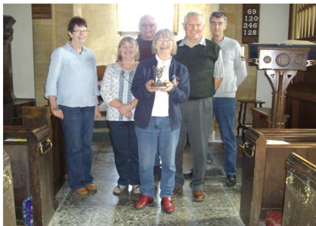
Pictured left – the winning team, Ashill, R-L